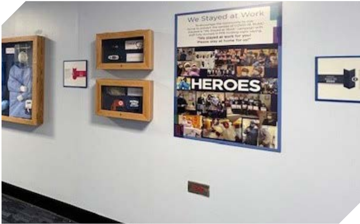
The timeline of events, items associated with the pandemic including PPE, masks, and an at-home COVID-19 test kit.