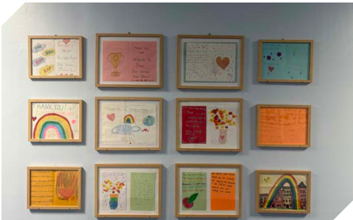
Artwork sent to the hospital from local schools during the pandemic. The drawings were sent by students to uplift the spirits of the hospital staff.