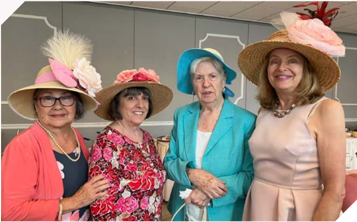
Attendees for the 2025 Spring Brunch were encouraged to wear festive hats.