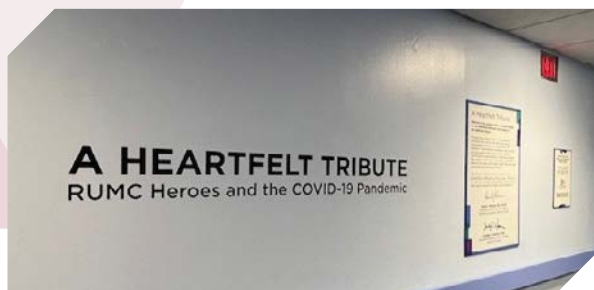
The title of the new exhibit adorns the wall along with a welcome from hospital leadership.

On June 25, Richmond University Medical Center unveiled its new exhibit memorializing the hospital's response to the COVID-19 pandemic that began in 2020. The exhibit, located on the main floor adjacent to the lobby, is intended to shine a light on RUMC's frontline workers who worked tirelessly to provide continuous care to its patients as well as the generosity and support the hospital received from the community.