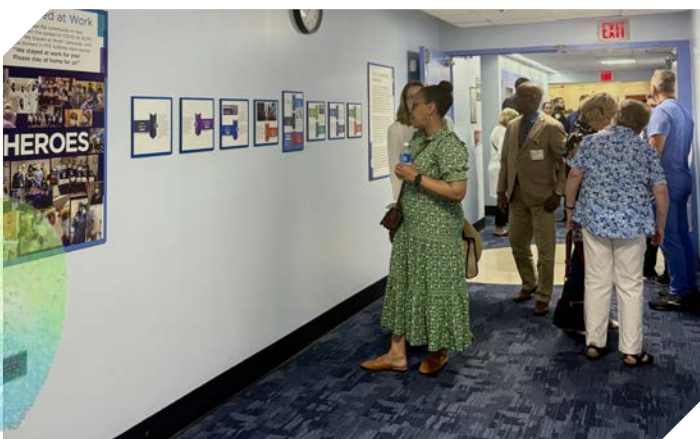
Staff and visitors viewing the exhibits timeline of events.