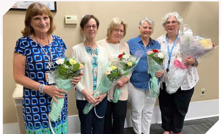
The new RUMC Auxiliary officers for 2025-2026.