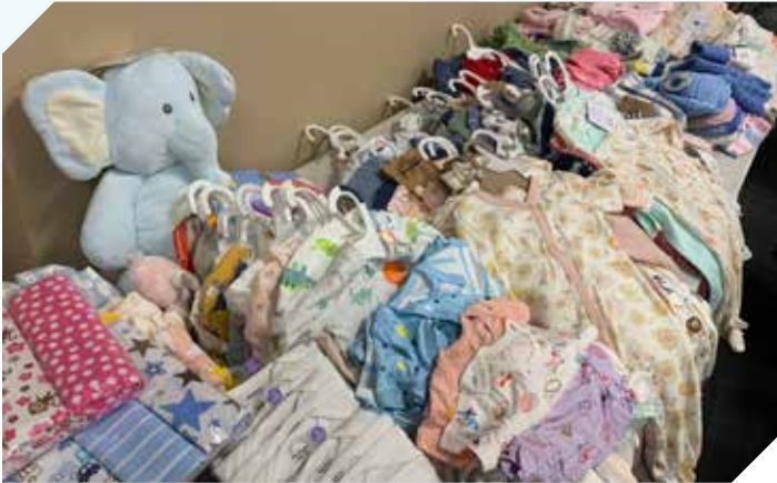
New baby clothing purchased by members of the RUMC Auxiliary.

then available to parents of newborns born at the hospital. RUMC welcomes nearly 3,000 newborns each year.