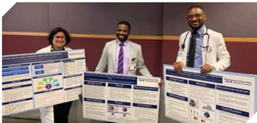
Representatives from the winning departments display with their projects selected by a panel of judges as winners for this year's symposium.

Throughout the day, posters were on display throughout the hospital's main lobby for staff and visitors to view and meet the teams who submitted the projects for consideration. A panel of judges from different departments selected the following as this year's winners: