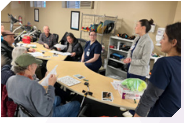
Speech pathologists lead a meeting of the group in the RUMC Comprehensive Rehabilitation Center