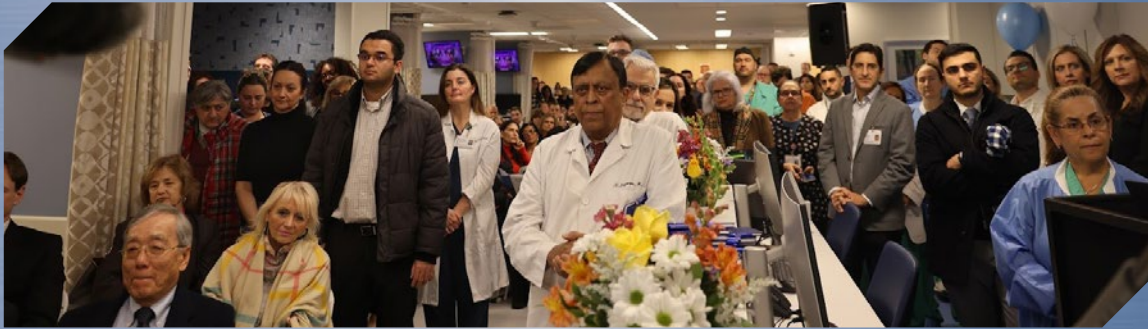
Over 300 family, friends, staff, and community leaders attended the ribbon cutting ceremony.