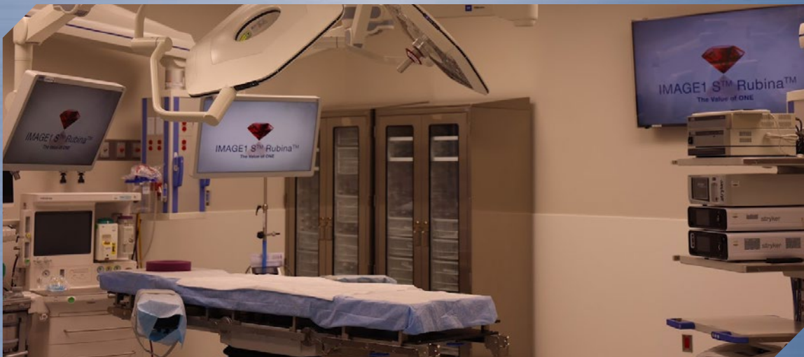
The 10 new operating suites are fully equipped for a variety of procedures. Three of the suites are configured to accommodate robotic surgery systems.