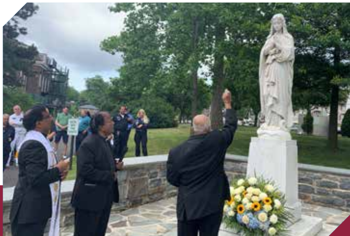
Members of the clergy blessing RUMC's statue of the Virgin Mary and the surrounding sanctuary.