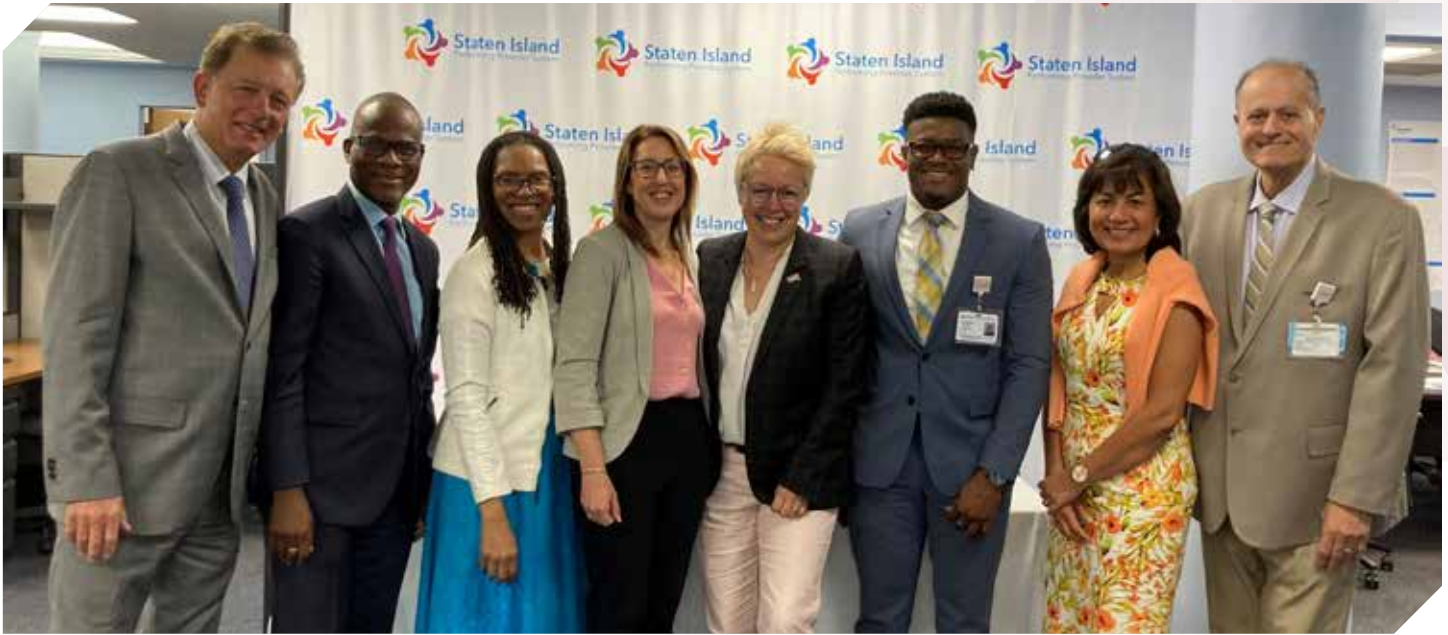
Members of the Staten Island Performing Provider System and Richmond University Medical Center with representatives from the Healthcare Financial Management Association of the United Kingdom.

The Staten Island Performing Provider System (SIPPS) recently hosted representatives from the Healthcare Financial Management Association (HFMA) of the United Kingdom. Richmond University Medical Center (RUMC) staff provided information on population health, behavioral health trends and other topics specific to care on Staten Island as part of the HFMA's