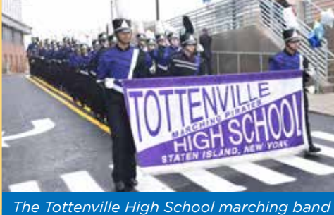
performed as part of the ceremony.