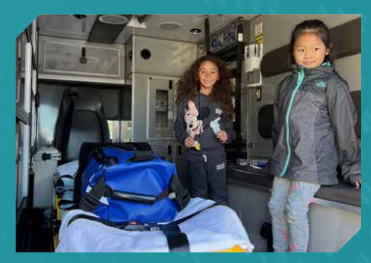
Kids had an opportunity to tour the inside of a RUMC ambulance.