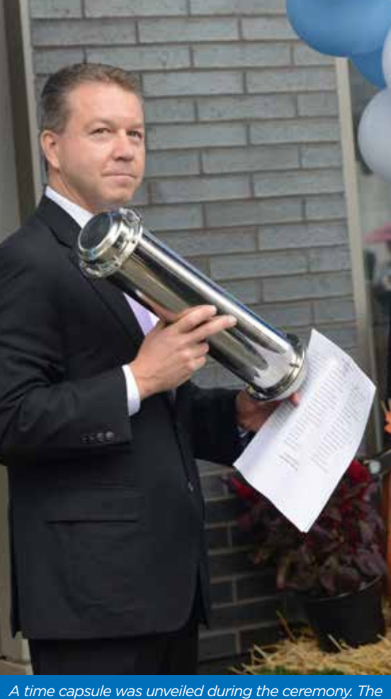
capsule will contain items from the opening of the ED, will be buried nearby and unearthed in 50 years.