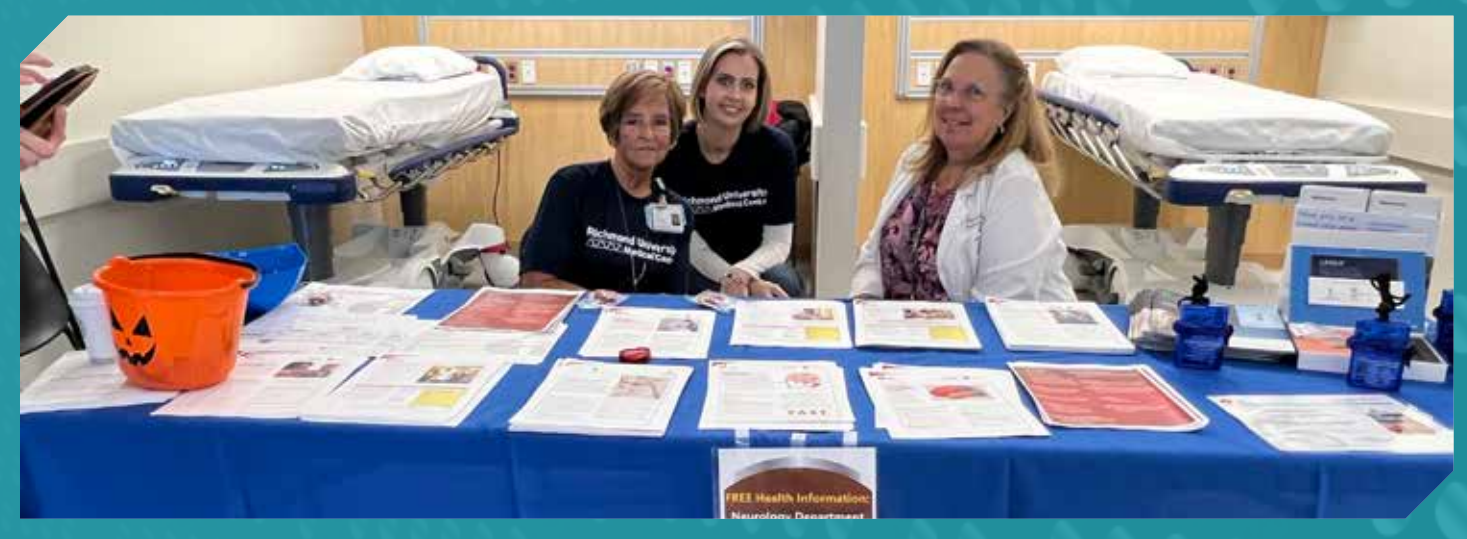
Over a dozen departments provided information on their services, including RUMC's stroke care team.