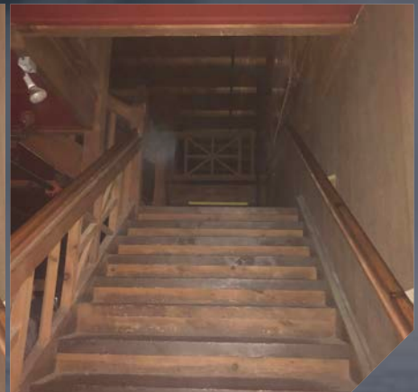
Taking rapid photos, I caught nothing in the first staircase photo and then a perfectly round orb moving up the stairs less than a second later. The orb turned right at the top and disappeared. It was also visible to the naked eye.