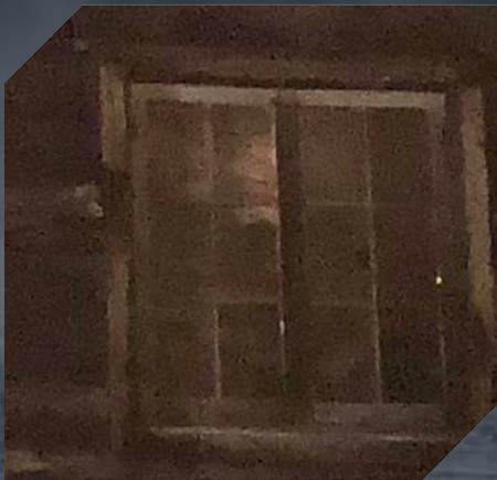
The figure of a person looking down from a second floor window is outlined. The second floor is closed during ghost tours due to lack of lighting and the staff has confirmed numerous sightings of a Native American who often appears in this room.

This past summer, I took a ghost tour at Fort William Henry in the Lake George region of upstate New York. As it is an attraction well known for being haunted, I snapped a few interesting photos: