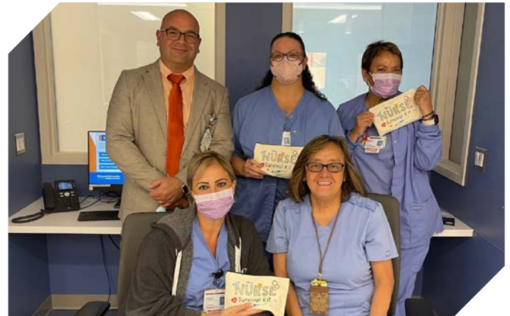
Care packages containing pens, snacks, and additional items were distributed to over 100 nurses at RUMC, including the staff in our new Medical Intensive Care Unit.

Students from Wagner College created over 100 care packages to let nurses at Richmond University Medical Center (RUMC) know that their dedication to others and commitment to their profession does not go unnoticed. The packages were delivered to RUMC on September 9. The delivery date was deliberately chosen as a way to honor Patriots Day and also remember the 21st anniversary of the September 11, 2001, attacks.