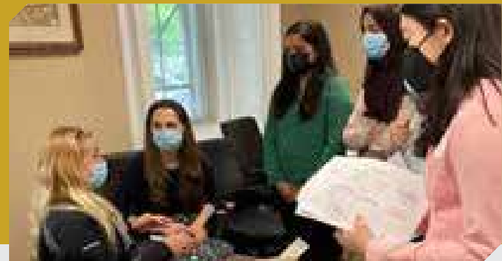
Blood Draws Station