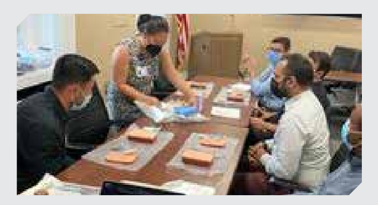
Stiching, Securing Lines, Avoiding needle sticks