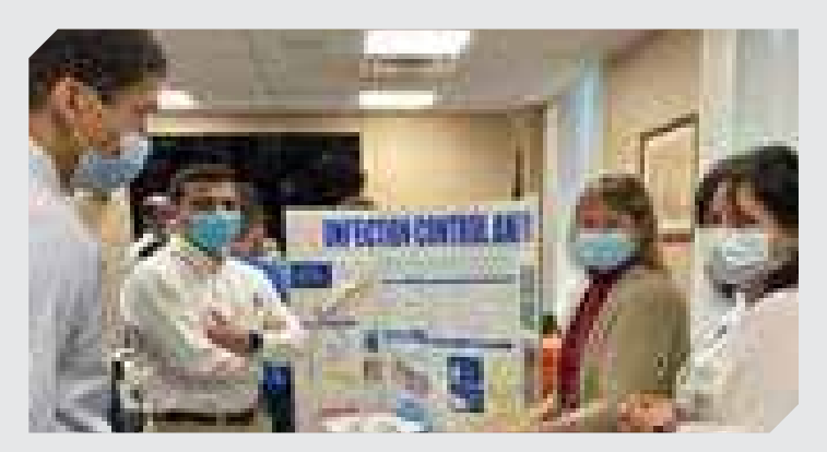
Infection Control Station