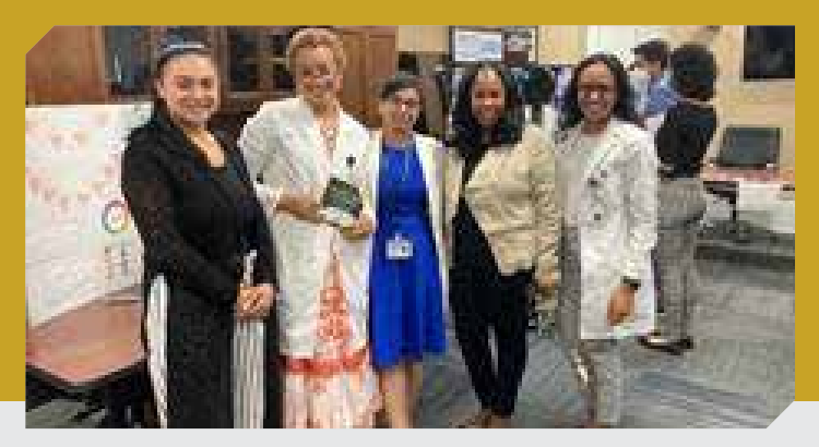
Resident Wellness Group