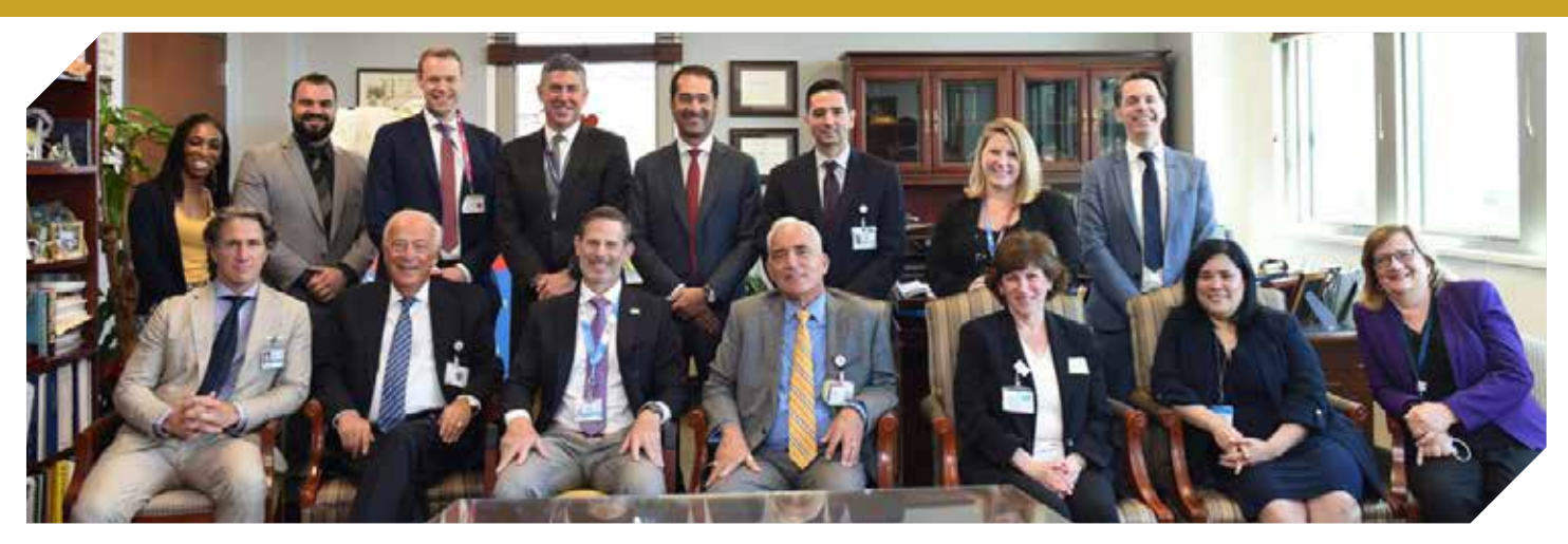
Medical staff and administrators from Richmond University Medical Center and Mount Sinai Health System.

Staten Island residents have gained more intimate access to some of New York City's most distinguished doctors and specialists, as Richmond University Medical Center (RUMC) officially embarks on an expanded clinical and academic partnership with Mount Sinai Health System.