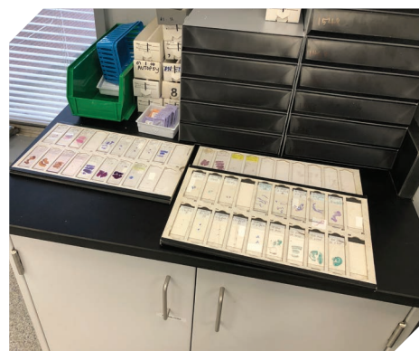
Tissue samples processed in the new histology lab are ready for analyzing by RUMC's team of technicians and pathologists.