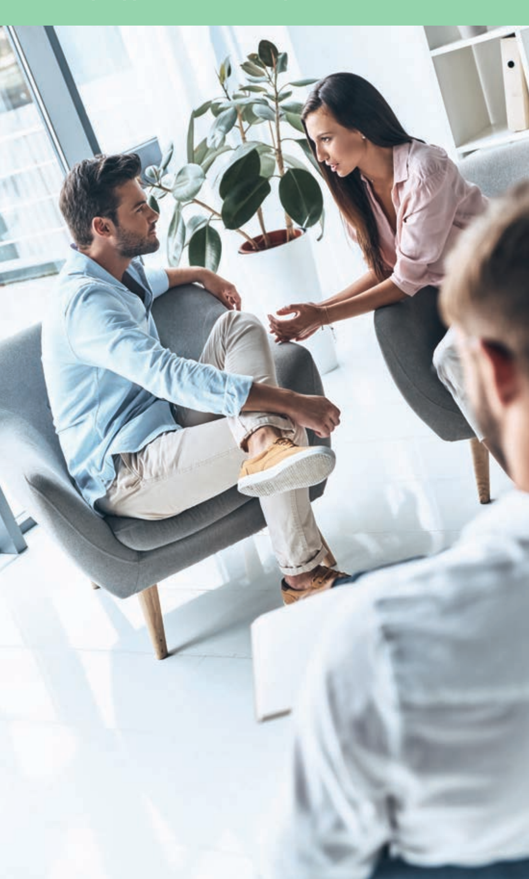
Family Support and Community Services